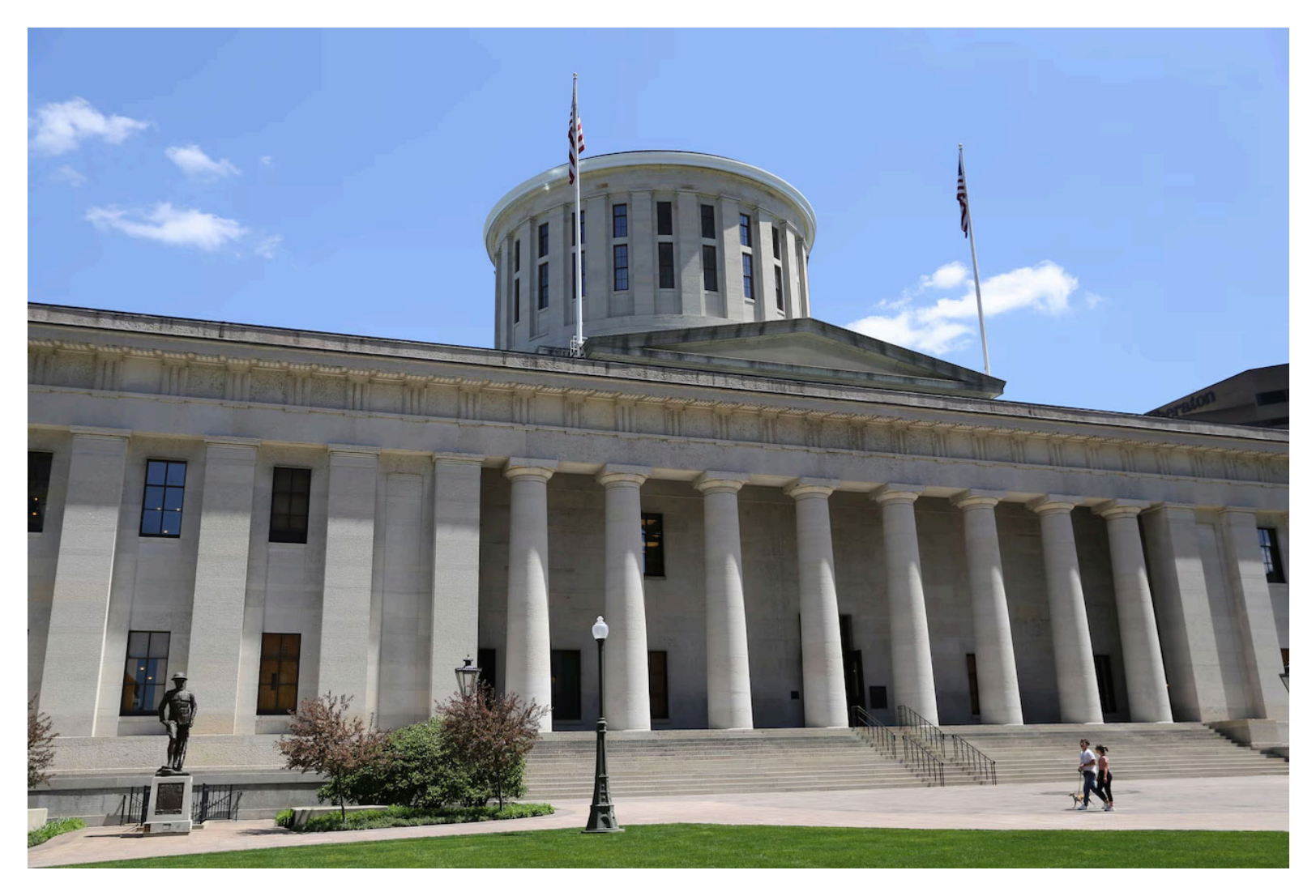
The Ohio Statehouse on Capitol Square in downtown Columbus.